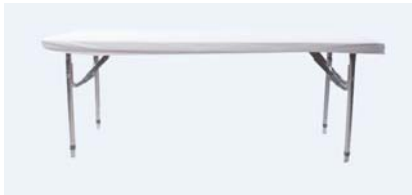
Table is delivered with plastic sheeting on top